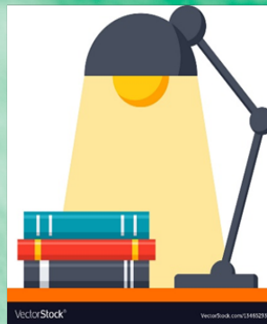
Studies, surveys, evidence gathering