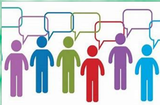
Dialogue with Stakeholders